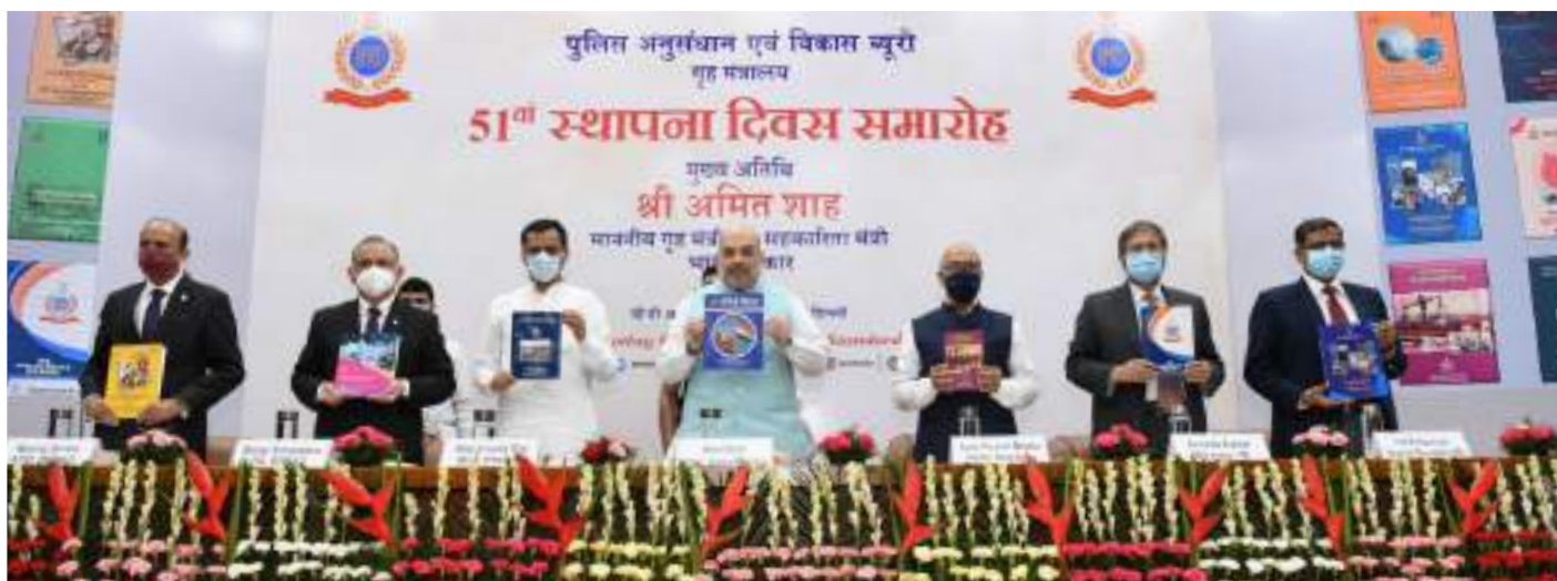
Hon'ble Union Home Minister and other dignitaries releasing various BPR&D Publications