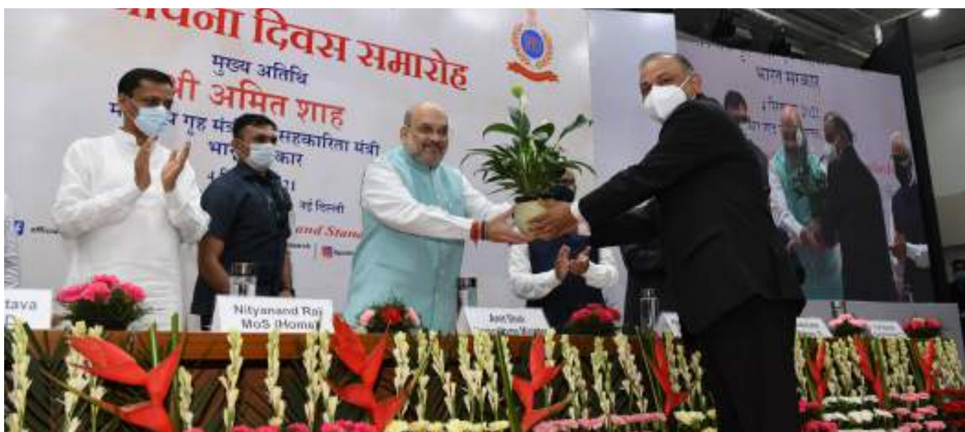
DG BPR&D felicitating the Chief Guest, the Hon'ble Home Minister and Minister of Cooperation, Shri Amit Shah, at the 51st Foundation Day Function of the BPR&D