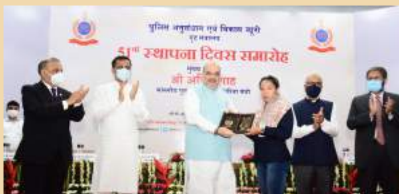
Hon'ble Chief Guest felicitating Ms Saikhom Mirabai Chanu, Silver Medalist, Tokyo Olympics 2020

Ms. Saikhom Mirabai Chanu, Silver Medalist at the Tokyo Olympics attended the function as a special invitee, where she was felicitated for her achievements at the recently concluded Tokyo Olympics. She was welcomed into the police fraternity as Additional Superintendent of Police, Manipur.