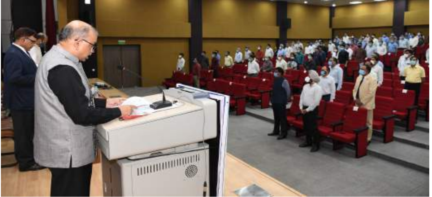
महानिदेशक, बीपीआरडी ने हिंदी दिवस के अवसर पर ब्यूरो के सभी अधिकारियों / कर्मचारियों को राजभाषा प्रतिज्ञा दिलाई

पुलिस अनुसंधान एवं विकास ब्यूरो द्वारा दिनांक 14 सितंबर, 2021 को महानिदेशक महोदय की अध्यक्षता में हिंदी दिवस समारोह का आयोजन किया गया, जिसमें माननीय केंद्रीय गृह मंत्री एवं सहकारिता मंत्री और गृह सचिव के संदेश पढ़े गये। इस अवसर पर महानिदेशक महोदय द्वारा राजभाषा प्रतिज्ञा दिलाई गई।