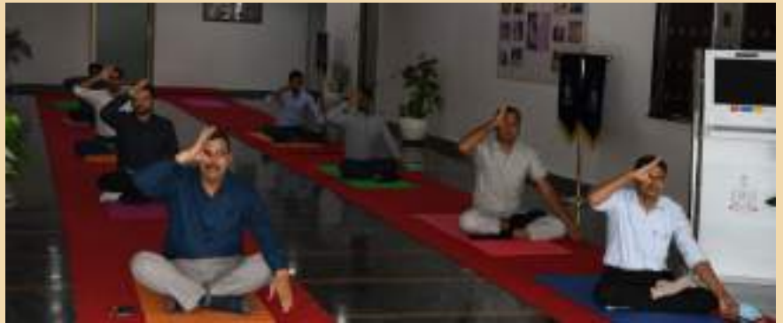
Team BPR&D practicing Yoga to mark the International Yoga Day