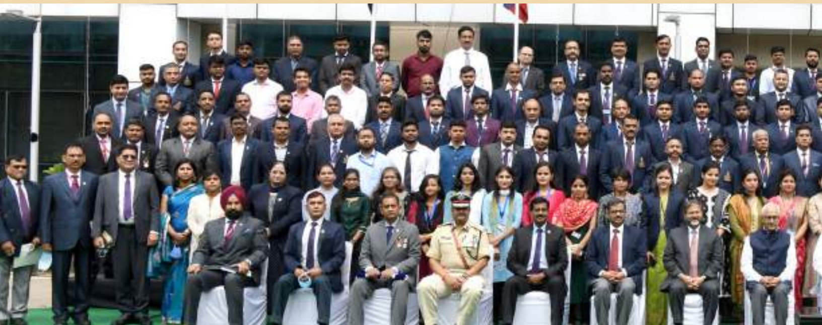
Hon'ble Home Minister with team BPR&D at the