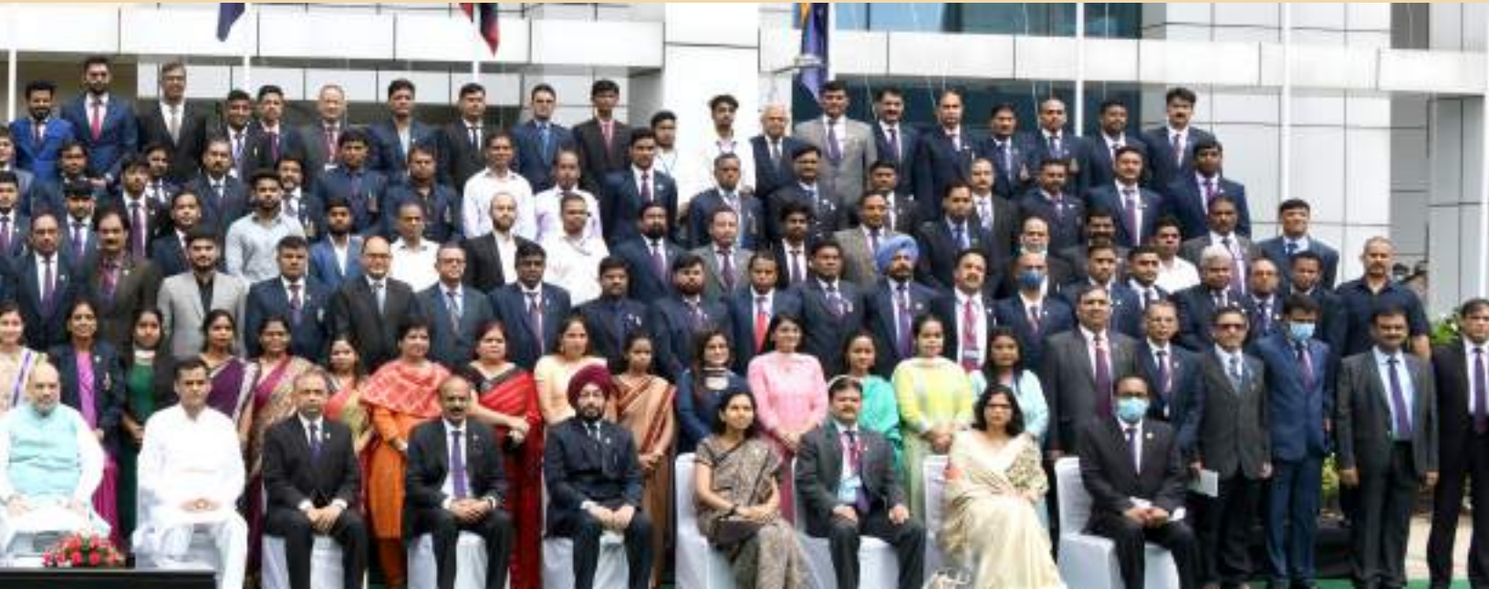
51st Foundation Day Celebration - 04.09.2021