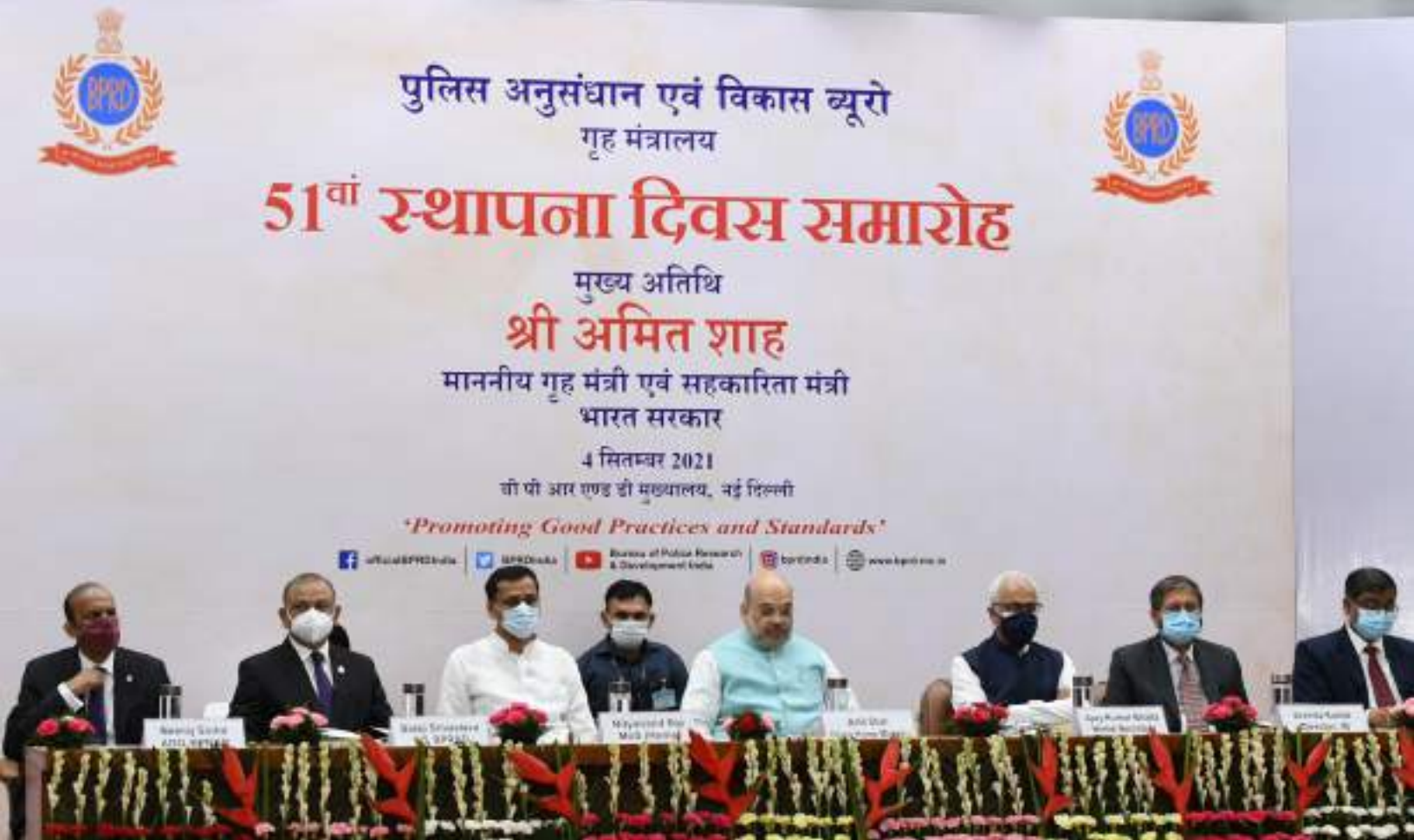
Hon'ble Union Home Minister and Minister of Cooperation, Shri Amit Shah and other dignitaries, at the 51st Foundation Day Function of the BPR&D.

Newsletter of the Bureau of Police Research and Development, Ministry of Home Affairs, Govt. of India