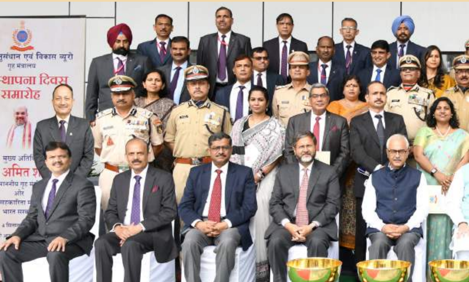
Hon'ble Home Minister with Officers of the BPR&D and Award winners