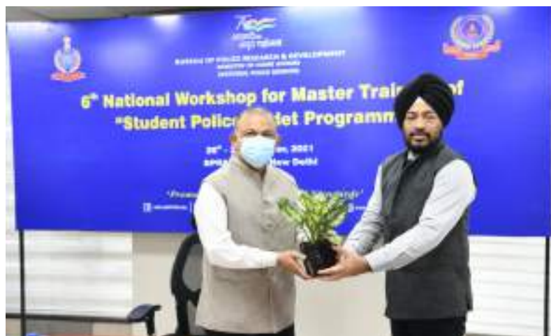
Director (NPM) welcoming the DG, BPR&D on the occasion of the 6th National Workshop for Master Trainers of SPC