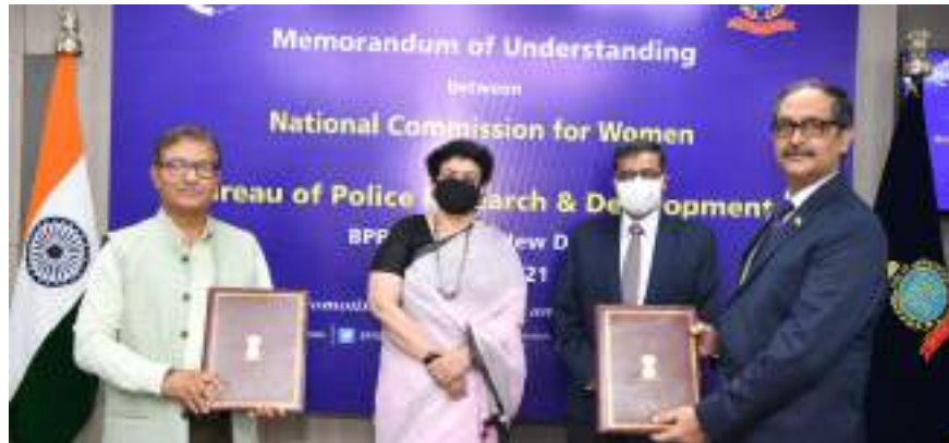
MoU signed with a view to initiating mutual co-operation for conducting gender sensitization programmes for Police Officers.

Memorandum of Understanding (MoU) signed between the National Commission for Women (NCW) and the Bureau of Police Research and Development (BPR&D) .