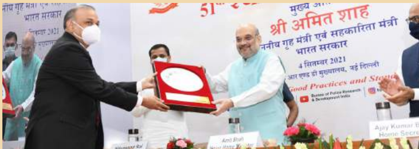
DG BPR&D felicitating the Chief Guest at the Foundation Day Function of the BPR&D