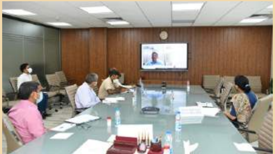
94 officers of the Prisons & Correctional Administration from different States & UTs attended the webinar.