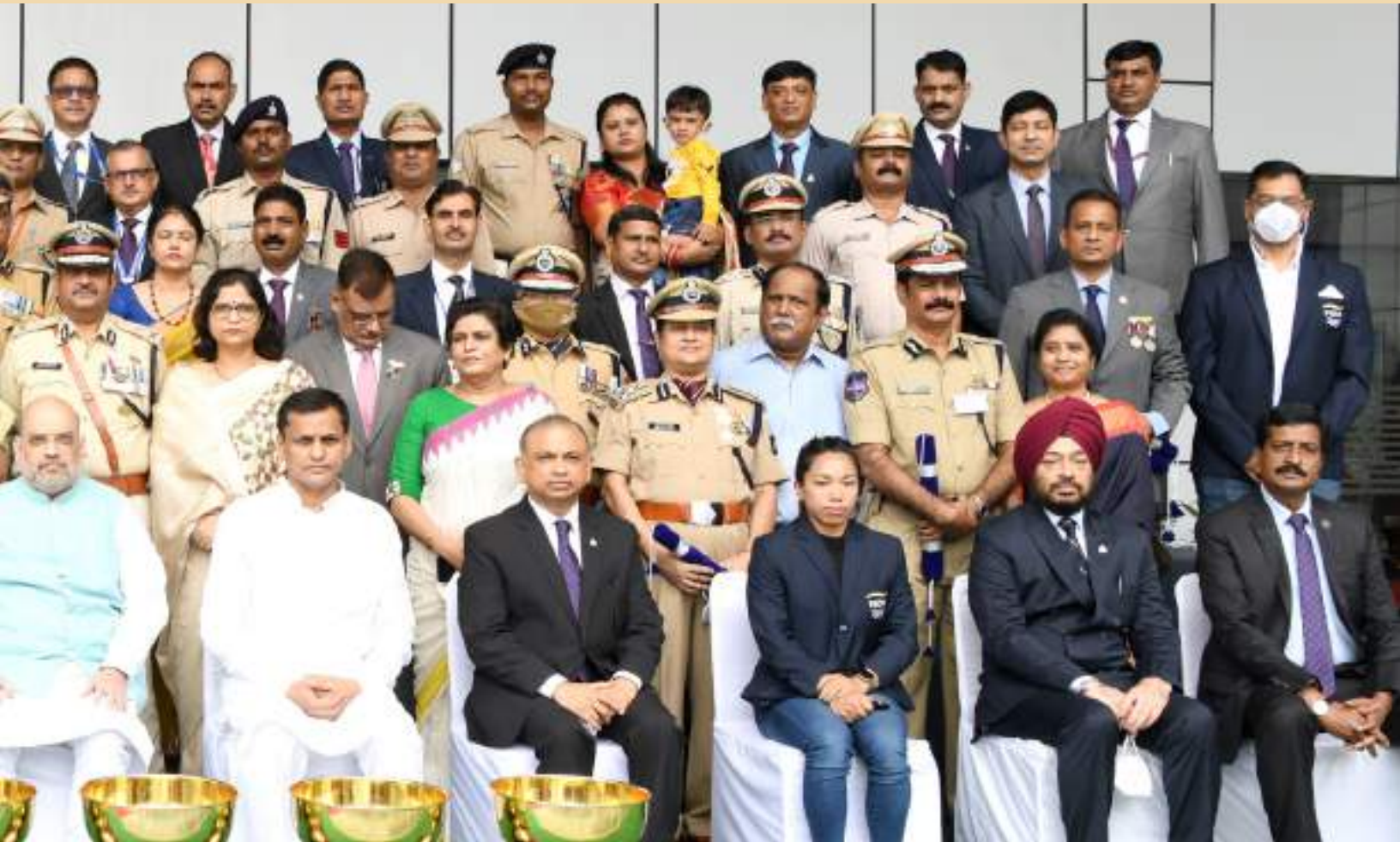
ers on the 51st Foundation Day Celebration - 04.09.2021