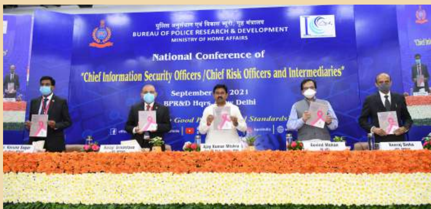
Hon'ble MoS (Home) Sh. Ajay Kumar Mishra, DG BPR&D Sh. Balaji Srivastava & other dignitaries releasing BPR&D publications during the CISO/CRO Conf.

A National Conference on ' Optimization of Facilities & Standardization of Training Curriculum ' was organised. It was attended by representatives of all the States/UTs.